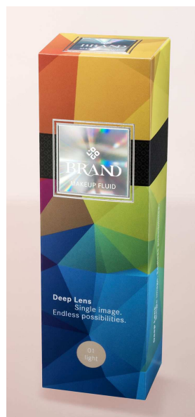
Hot stamping decoration with Deep Lens design