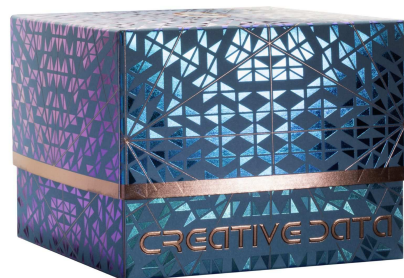
The Luxor MTS Polarlight stamping foil from Kurz changes color at different viewing angles