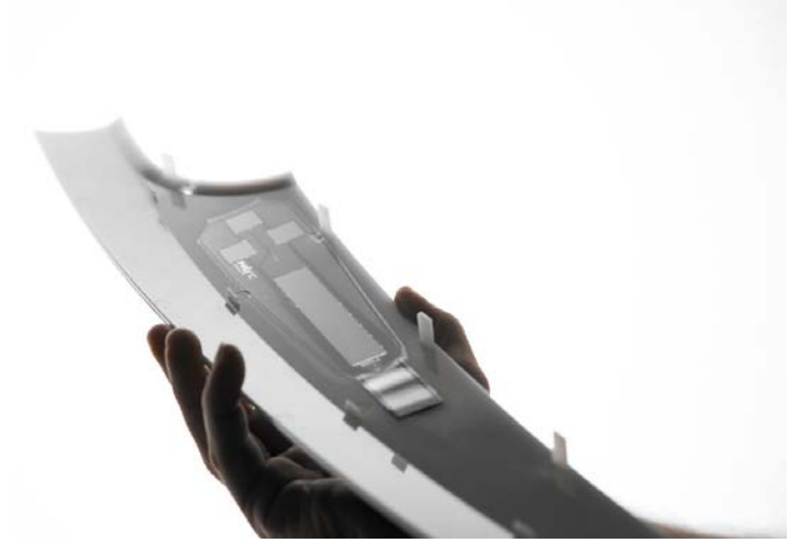
PolyTC touch sensor integrated by using the FFB process (Photo: Kurz)

Injection mold for the IMD PUR process that is being shown at the Kurz booth (Photo: Kurz)